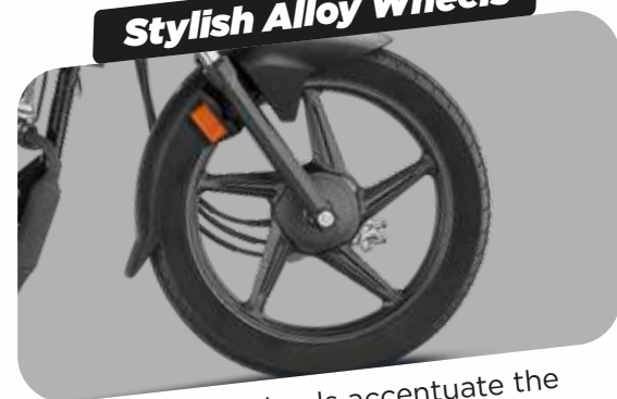
Stylish Alloy Wheels All-black alloy wheels accentuate the overall look of the bike.