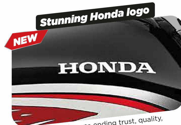
The symbol of never-ending trust, quality, and reliability.